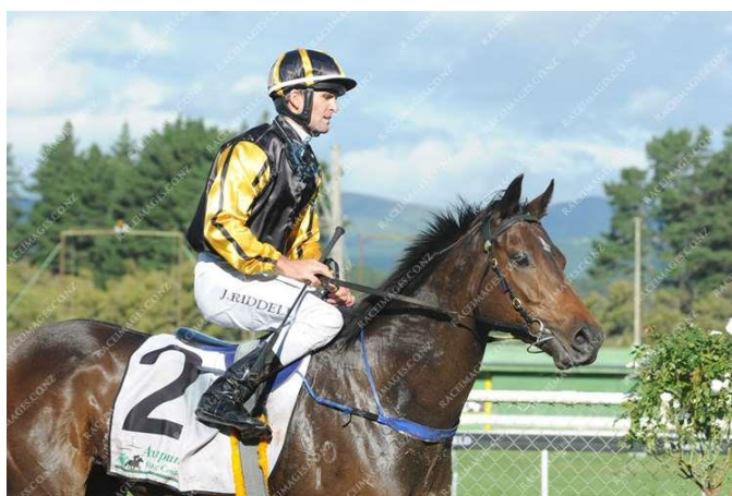
TAKEN THE LIBERTY (O'Reilly/Starbelly) returns to scale at Awapuni

Out to spell over the next 6 weeks or so she may not come back bigger but she will be stronger and if her four year old year is anything to go by....next season will see her name up in lights yet again.