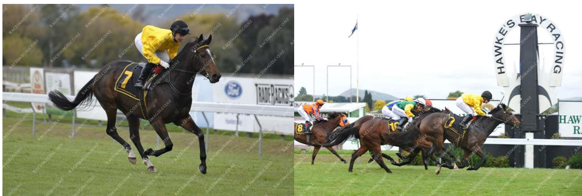
MAE WEST (Sir Percy/Wee Tipple) 5 wins from 18 starts and she's just coming into it.