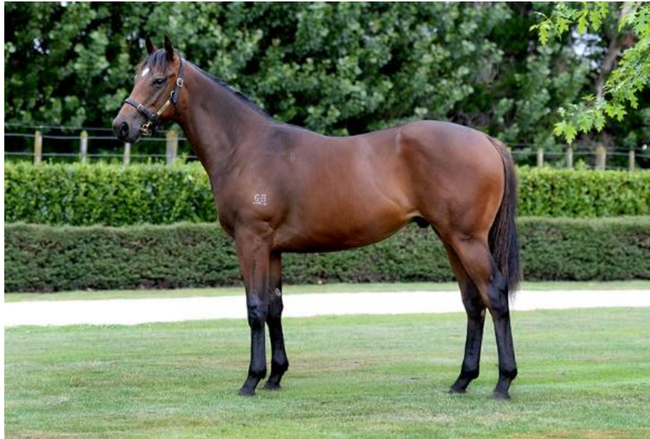
STRATUM/DRESSED prior to Karaka Yearling Sales

As I mentioned previously I am now an approved Authorised Syndicator with NZ Thoroughbred Racing and some of you may have seen the television advertisement currently on Trackside for the horse pictured below.